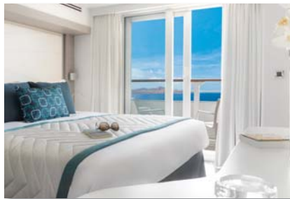
Stateroom with Balcony

The state-of-the-art propulsion system and custom-built stabilizers provide an exceptionally smooth, quiet and comfortable voyage. By design, the ship is energy efficient and environmentally protective of marine ecosystems and has been awarded the prestigious "Clean Ship" designation due to its advanced eco-friendly features, a rarity among ocean-cruising vessels. The ship has two tenders.