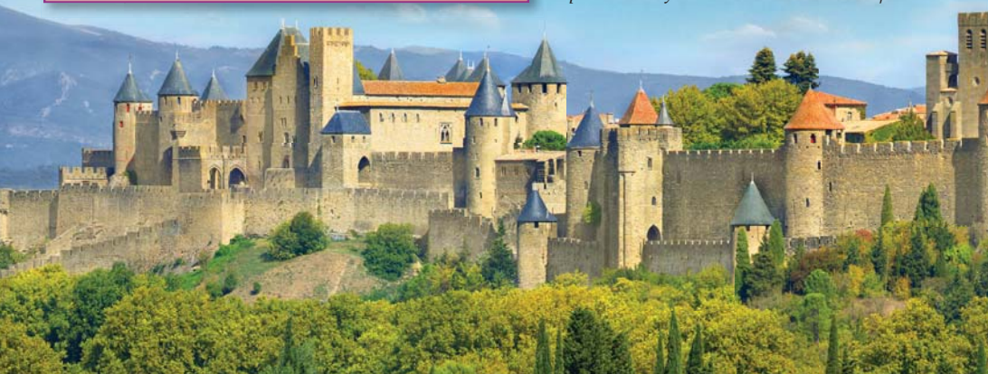
Photo this page: A fairy-tale image of towers and drawbridges, the medieval town of Carcassonne is protected by double walls nine to 15 feet thick.

Cover photo: Brightly painted houses and fishing boats line Portofino's waterfront on the Italian Riviera.