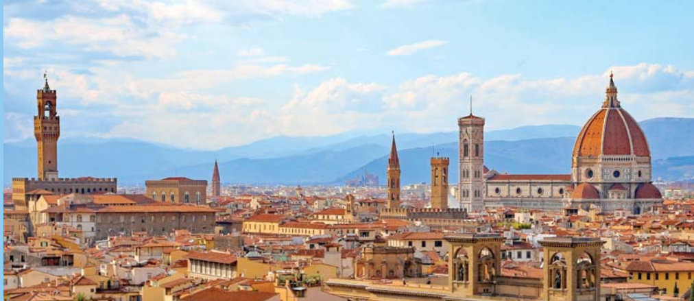
The distinctive early-14 th -century tower of the Palazzo Vecchio and Filippo Brunelleschi's magnificent 15 th -century dome are consummate symbols of Florence and the Renaissance.